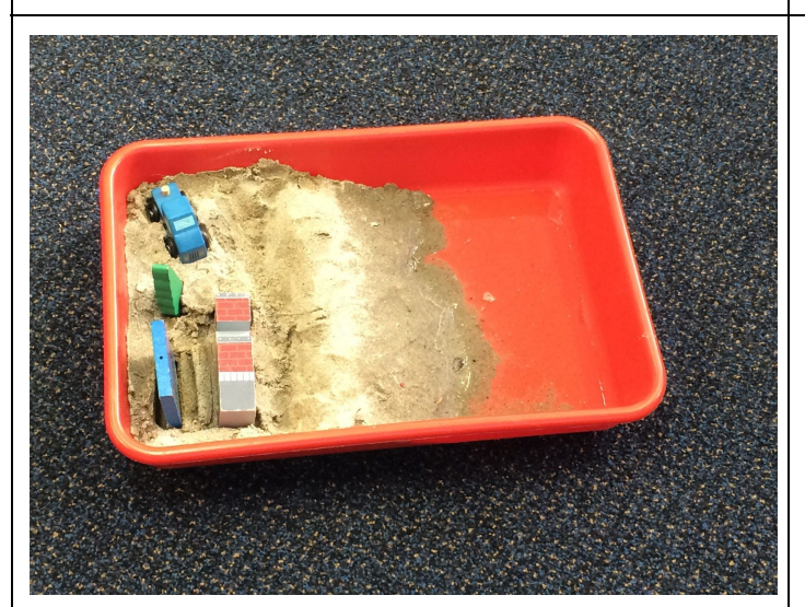
Pukeko and Nga Ringa doing investigations in preparation for our sand dune trip next week.