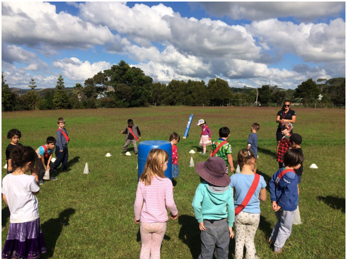
Pukeko and Nga Ringa classes learning about the traditional game Ki O Rahi. We did lots of running and had lots of fun.