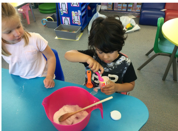
Pukeko class making playdough.